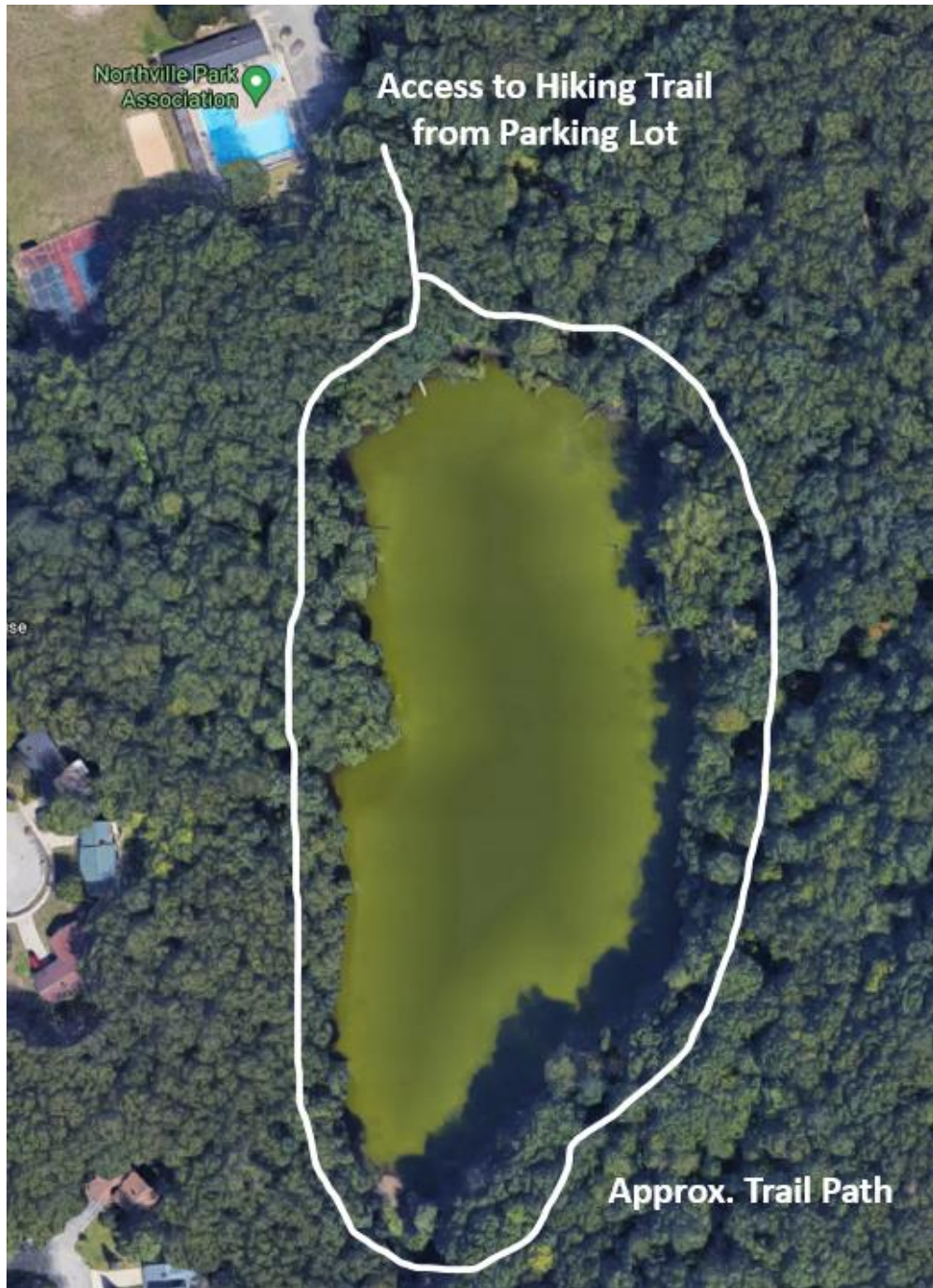
Figure 4 Pond and Hiking Trails

The pond and hiking trail can be accessed by the trailhead at the south end of the Primary Parking & Turnaround Loop. The hiking trail is well-defined yet rustic and allows for a scenic walk around the pond. The pond has a mock bottom which supports a variety of aquatic life. Although not ideal for wading or swimming in, it is a nice place to relax and watch nature. The pond and trail are not supervised and are to be used at your own risk.