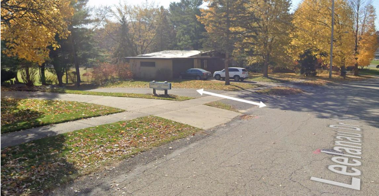
Figure 2 Park Entrance/Exit (Leelanau Dr)

All members and guest must enter and exit the park from Leelanau Drive. Please be aware and consider that this is in a residential neighborhood with many kids playing and pedestrians walking.