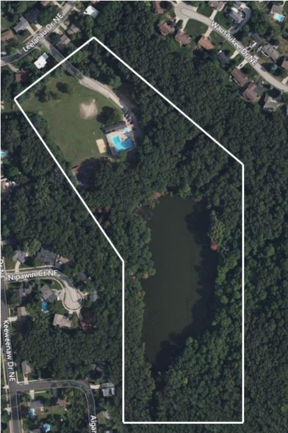
Figure 1 Park Property (approx.)